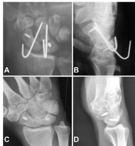
Figure 4. Immediate postoperative radiographs show restoration of carpal alignment (A and B). 24-months follow-up the imaging exams still demonstrate the maintenance of reduction (C and D).

Plain radiographs from this period also showed the maintenance of carpal alignment (Figure 4).