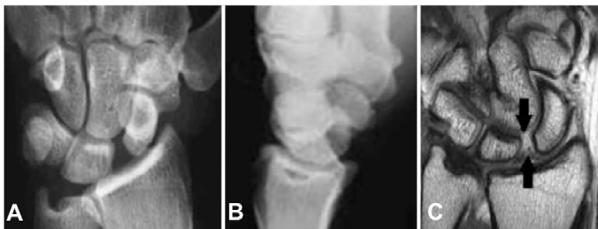
Figure 2. Radiographs from a 36-year-old male patient who suffered a wrist trauma with 4 months of follow-up, demonstrating an increased scapholunate interval and a DISI deformity (A and B). Magnetic resonance imaging showing a complete tear of scapholunate interosseous ligament (C).

At that point, surgical intervention was recommended using the reconstructive procedure with double dorsal capsulodesis, as described above (Figure 3).